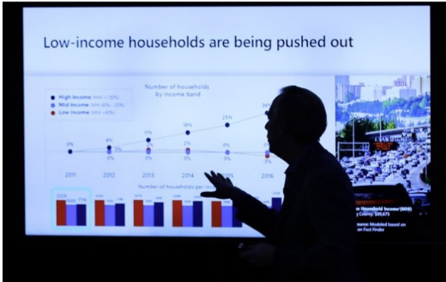
Microsoft President Brad Smith speaks Thursday at a news conference in Bellevue to announce a $500 million pledge by the company to develop affordable housing and also to address homelessness in the greater... More

Originally published January 16, 2019 at 6:00 pm | Updated January 17, 2019 at 1:11 pm